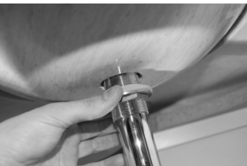
Above: Drain Attachment

* Occasionally plumbers putty or silicone may be required between the drain and sink to ensure a leak proof seal. Test this by running the water and evaluating.